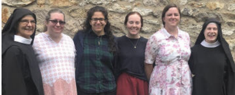
June 10-12 Four wonderful young women participated in our Summer Monastic Experience Weekend.