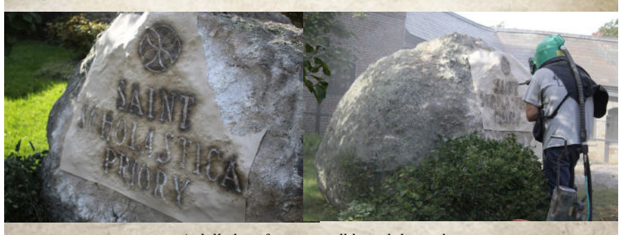
A skilled craftsman sandblasted the rock

There are so many scriptural references to rocks: "who is a rock, except our God" (2 Sam 22:32), "building a house, who dug deeply and laid the foundation on rock" (Lk 6:48) and many more. For us it gives an image to Benedictine stability and perseverance in praising God here for many generations to come! St Mary's has one too!