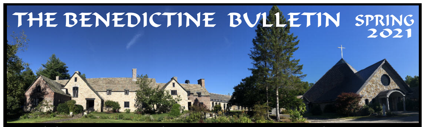
St. Scholastica Priory, 271 North Main Street, PO Box 606, Petersham, MA 01366