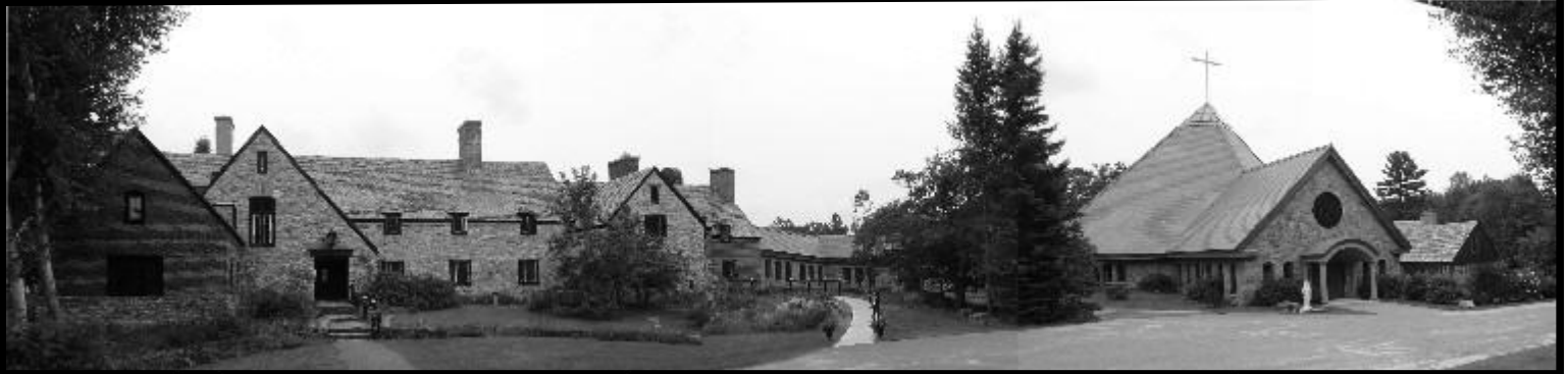
St. Scholastica Priory, 271 North Main Street, PO Box 606, Petersham, MA 01366