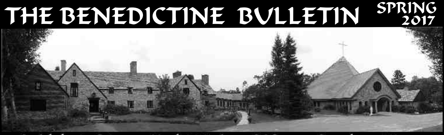
St. Scholastica Priory, 271 North Main Street, PO Box 606, Petersham, MA 01366